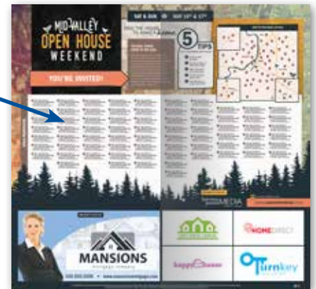
Double Truck (2 full pages)

Sponsorship positions are available separately from the listing package. See your Statesman Journal representative for more information on sponsorship opportunities.